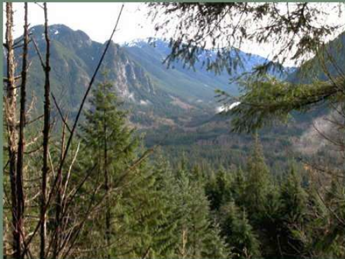
Looking east from the CCC road, this photo again looks into the Pratt Valley. A close up is shown to the right

ONE BIG TREE.... Think about a 'big tree'. The Pratt Valley has "one". A friend took a picture from over two miles away. And it's readily seen, standing easily over it's neighbors. It was originally measured at 250 feet tall, but some time ago, it lost about 82 feet of it's top. Still at about 170 feet tall, there it is. It may have been left by original loggers, maybe because it was a broken off top, or perhaps too big and they thought they would get it later. It's accessible by a faint trail off of the main Pratt trail. Which can be reached in summer by wading the Middle Fork river. Or soon, the US Forest Service will reopen the 'along river portion' trail that goes down river from Middle Fork Trail Head.