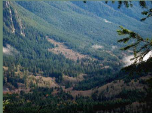
Look closely at this zoom photo (or even better, open it up and zoom in more) and you can see the distinctive Pratt Valley giant tree. The tree is almost dead-center at the bottom of the distinct brushy area.

This picture is provided and copyrighted by http://middleforkgiants.com./ Pretty impressive. One can even see it from Google Earth, by noting it's sun shadow. (Bill Davis)